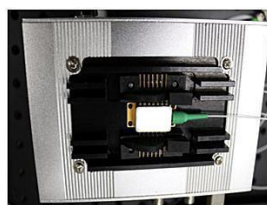
1550nm PM SLD Laser diode

polarization-maintaining SLD laser test as an example)