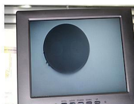
Slow axis alignment