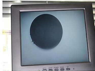
Slow axis alignment