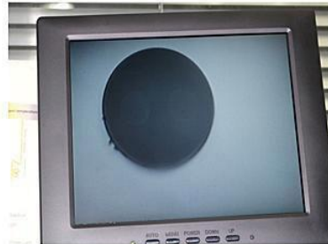
Slow axis alignment