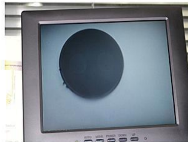
Slow axis alignment