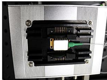
1550nm PM SLD Laser diode

polarization-maintaining SLD laser test as an example)