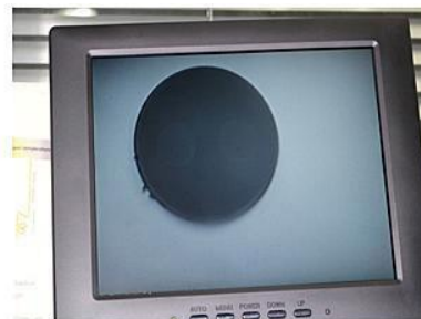
Slow axis alignment