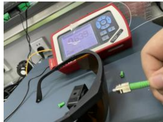
Power after laser protective goggles