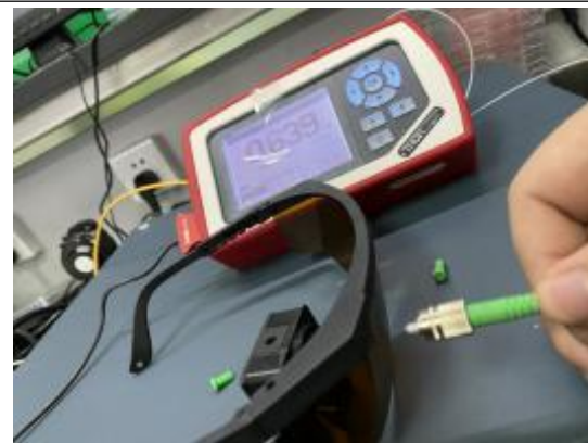
Power after laser protective goggles