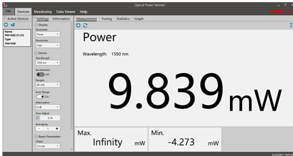
Laser power before connecting to fiber patch cord