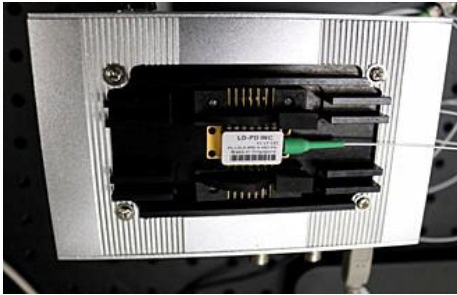
488nm PM FP Laser diode

(Tested with an FP laser, center wavelength 488nm, spectral width: 30nm, 2.5 mW polarization-maintaining laser as an example)