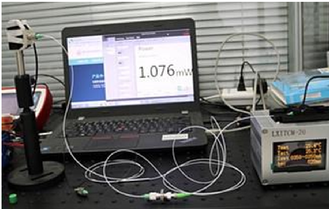
MP-FBC-W0488-S1-CR5050-1-9-PA-35T White port @0488nm