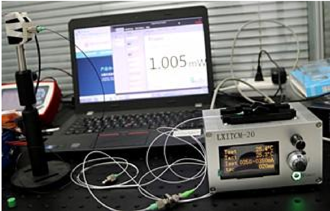
MP-FBC-W0488-S1-CR5050-1-9-PA-35T Black port @0488nm