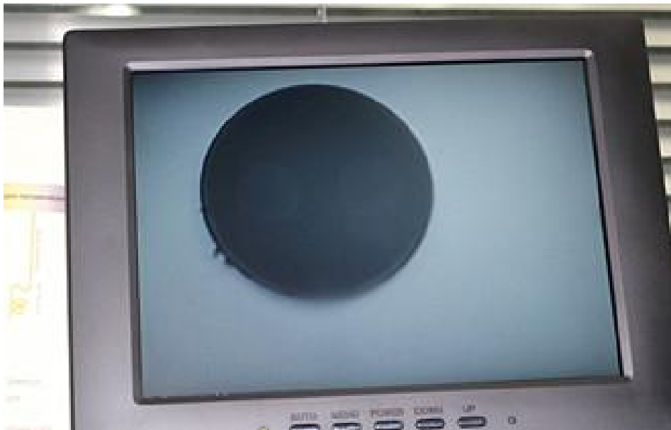
Slow Axis Alignment